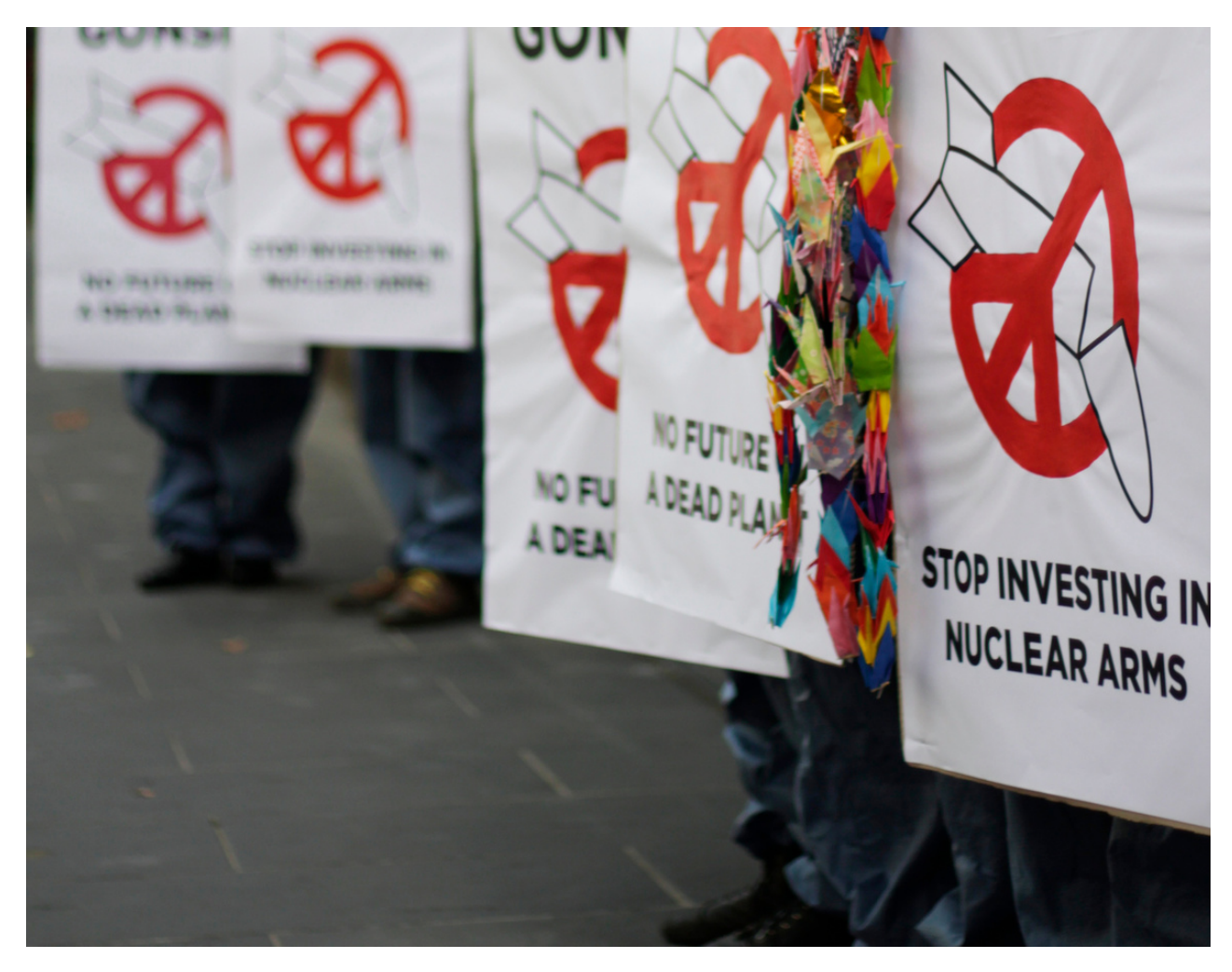
A protest in Melbourne, Australia, against investments in companies that manufacture nuclear weapons