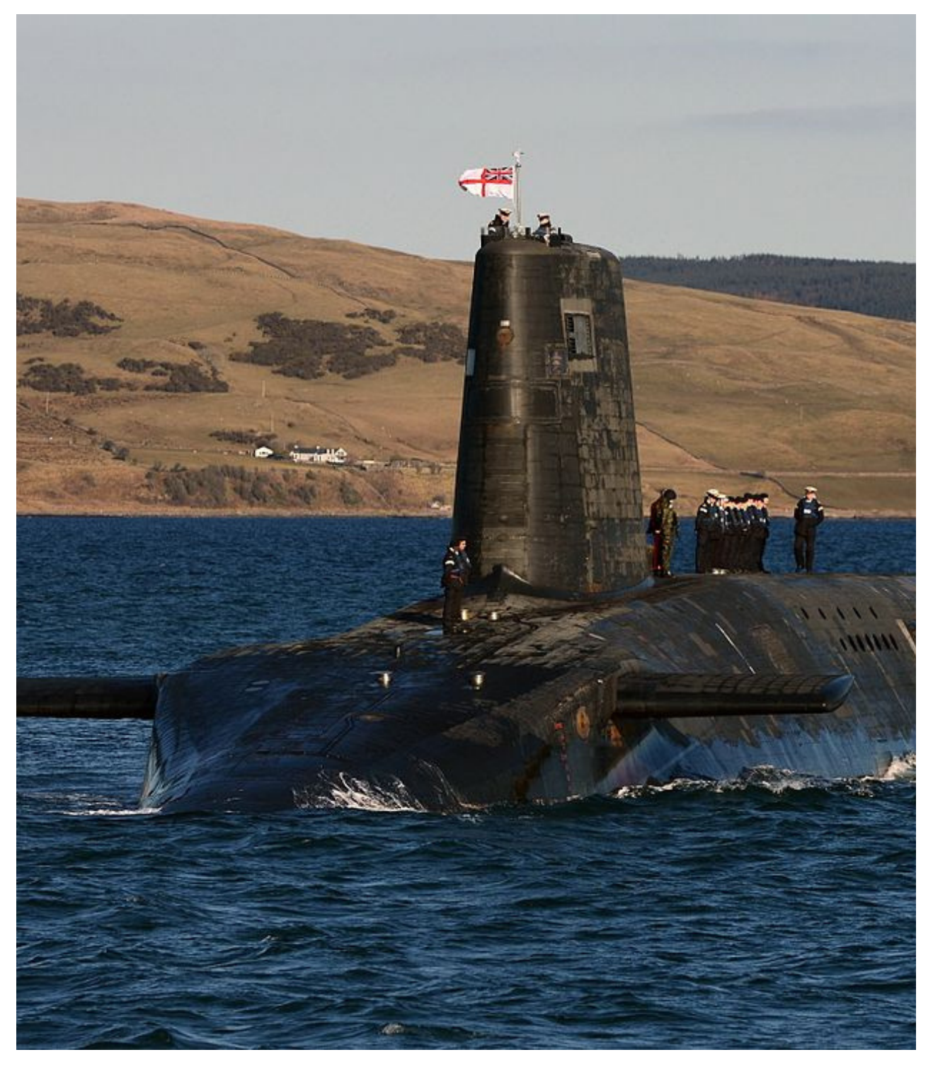
Trident nuclear submarine, HMS Victorious, pictured near Faslane in Scotland.

Overall, the UK's nuclear weapons programme for a continued toxic legacy, highlighting the urgent need for disarmament and nuclear divestment initiatives to prioritise human and environmental health.