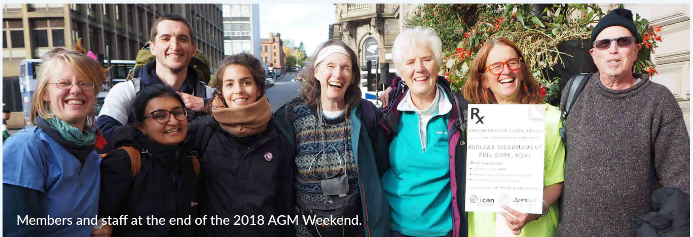
Members and staff at the end of the 2018 AGM Weekend.