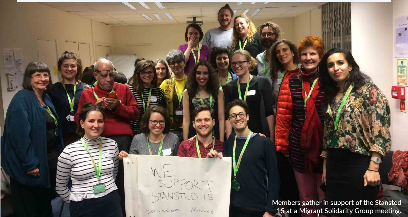
Members gather in support of the Stansted 15 at a Migrant Solidarity Group meeting.