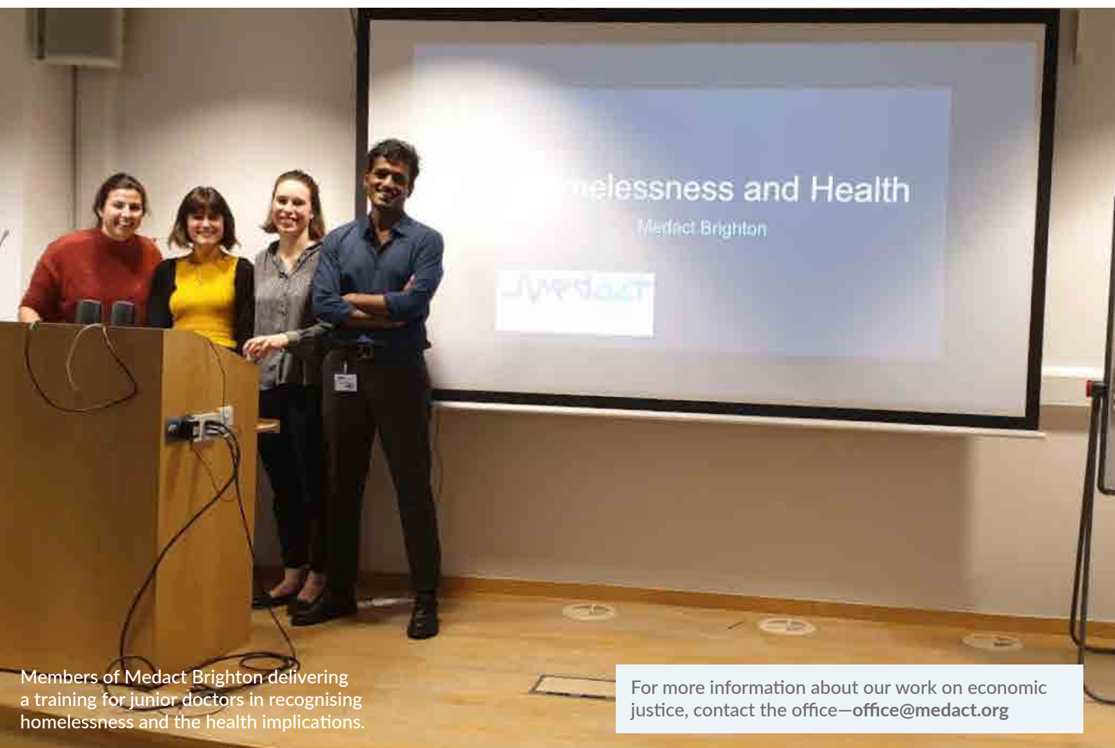
Members of Medact Brighton delivering a training for junior doctors in recognising homelessness and the health implications.

Aware that much more is needed to build our work in this area, we are delighted to have secured funding from the Friends Provident Foundation for a new member of the team to lead on this. We are very excited about the potential this new role offers to build more strategic campaigning on the intersections of health and poverty in the coming year, and very much look forward to supporting members across the UK with this.