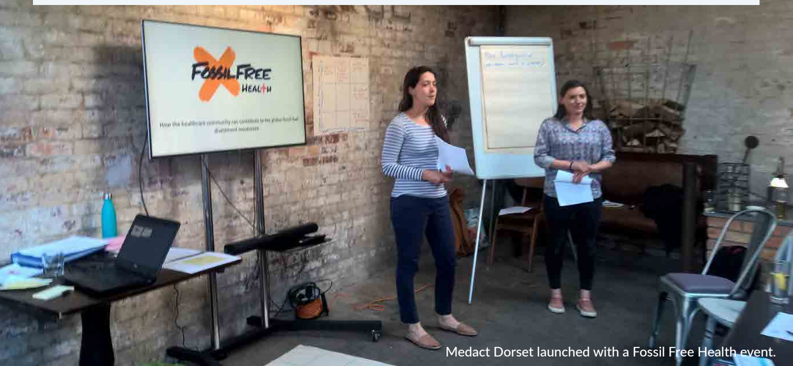
Medact Dorset launched with a Fossil Free Health event.

We have also continued to support healthcare workers who are opposing the fracking industry, and helped members to participate in a number of climate actions –including the march for climate justice before the UN COP24 talks in December 2018, and a mass lobby for climate action at Westminster in June 2019.