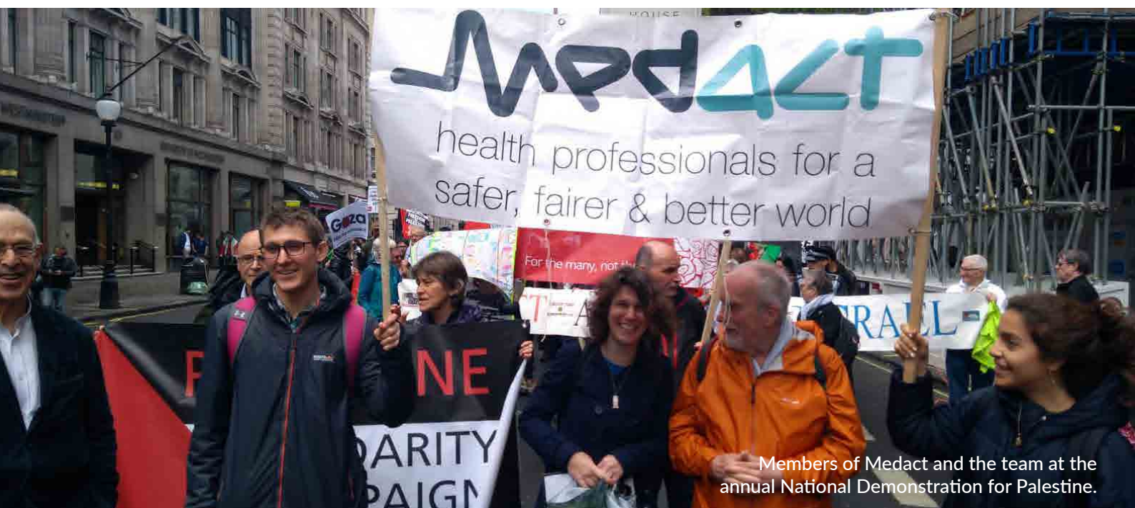
Members of Medact and the team at the annual National Demonstration for Palestine.

This summer we are writing to the Department for International Trade (DIT) alongside hundreds of health workers to urge them to stop supporting the Defence and Security Equipment International (DSEI) arms fair that will be taking place in London this September. We will also be taking action against DSEI, the world's largest arms fair, in an event to coincide with Medact's AGM.