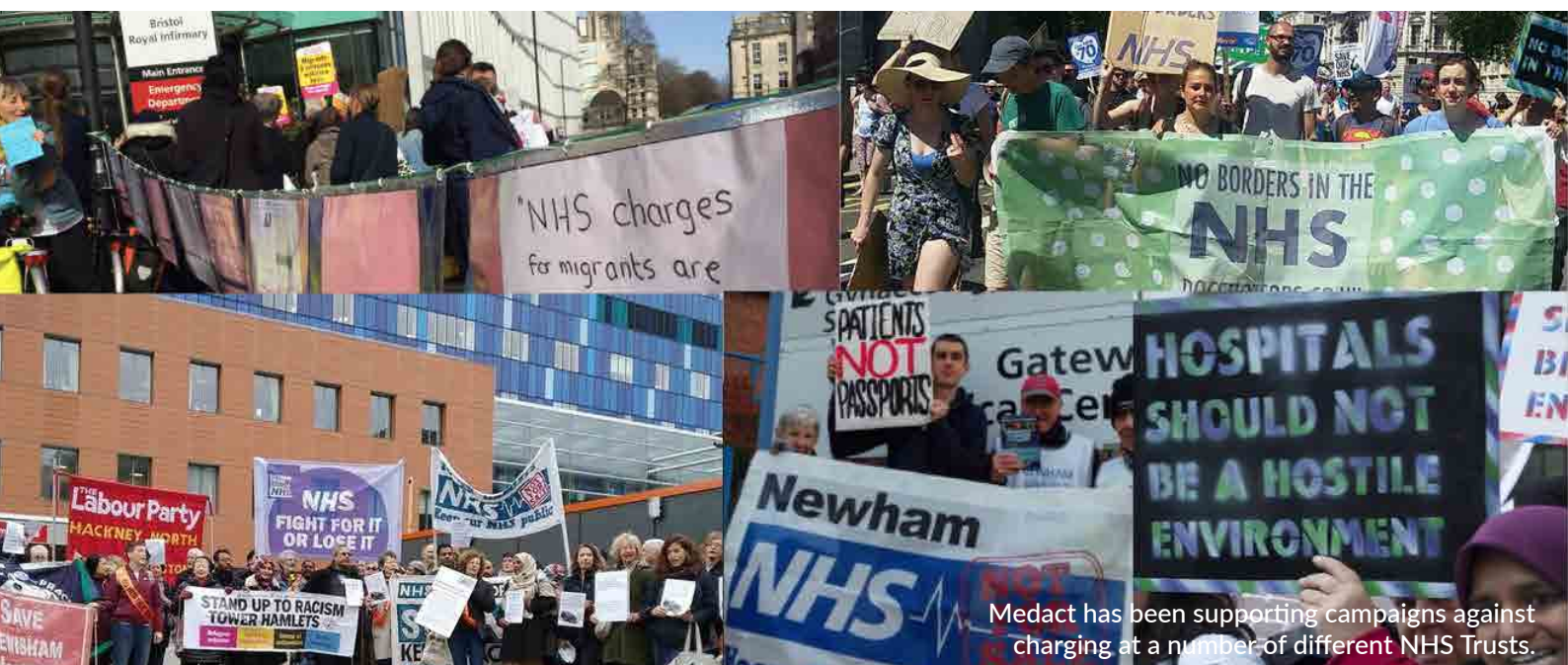
Medact has been supporting campaigns against charging at a number of different NHS Trusts.

We're excited to announce that we've joined forces with Migrants Organise and the New Economics Foundation and secured funding for the next two years. This will allow us to continue organising in NHS Trusts around the country and to develop community organising and research projects that will strengthen the campaign.