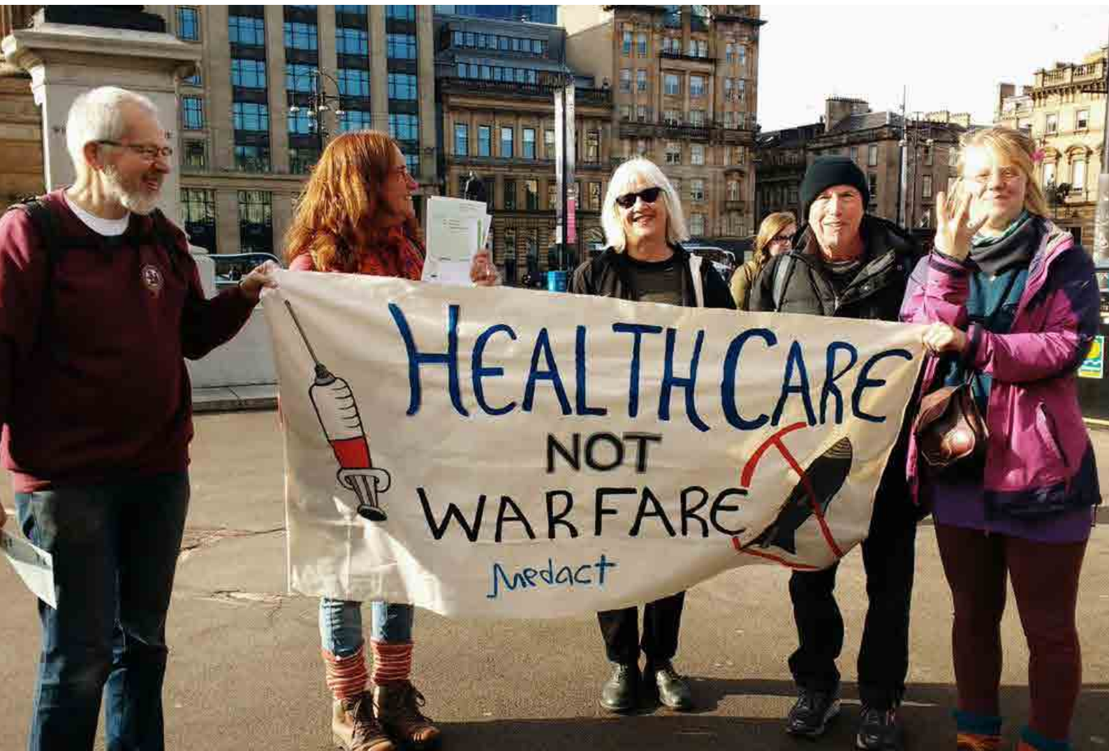
Members of Medact Scotland before the Nae Nukes Anywhere demo at Faslane.

Get in touch to get involved: yorkshire@medact.org