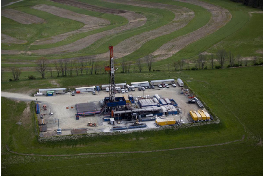
Gas well drilling rigs in USA.